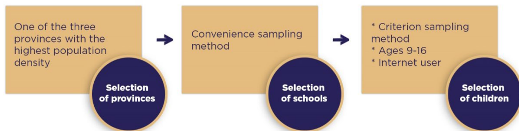
Figure 2. Data collection process

Quantitative and qualitative data were collected within the scope of the research. The process followed in the data collection process is given in Figure 2.