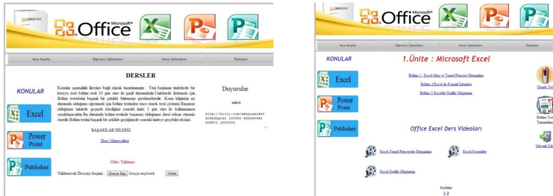
Figure 3: Course page and materials

intermediate test was applied to the students through the system. After the test, the student who cannot get the previously determined score can repeat the subject and take the test again, then proceed to the next subject. Some screenshots about the Office Master intelligent tutoring system are given in Figure 3