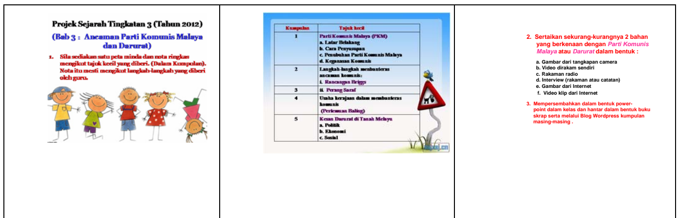
Figure 1. Direction for each group to their topic

Topic which had given to the students from Chapter 3: Malayan Communist Party and Malayan Emergency .